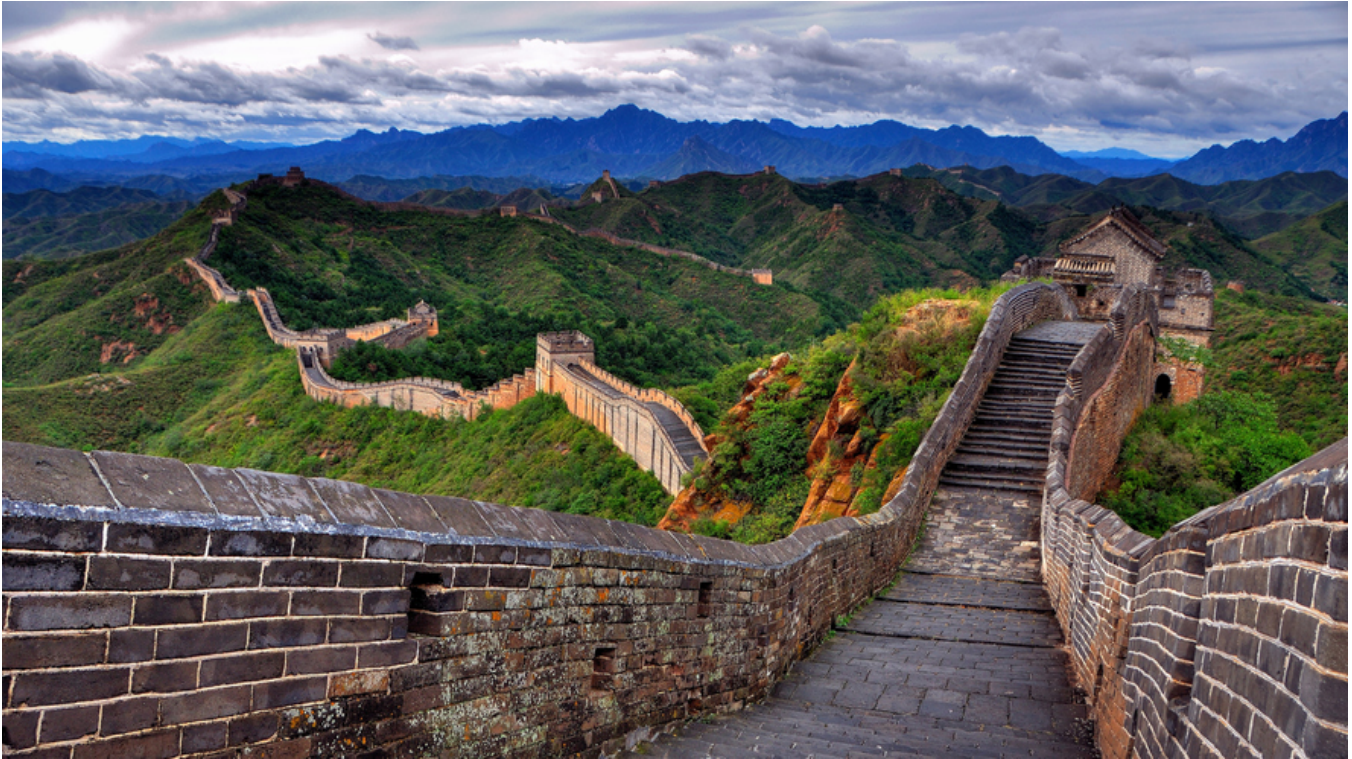
Image 1: The Great Wall of China is a popular place for tourists to visit. It is the longest man-made structure in the world. Parts of it were first built 2,700 years ago.

China is a large country. It is located in Asia. China's land stretches 3,100 miles wide. That is a little wider than the United States. The land includes mountains, deserts and forests.