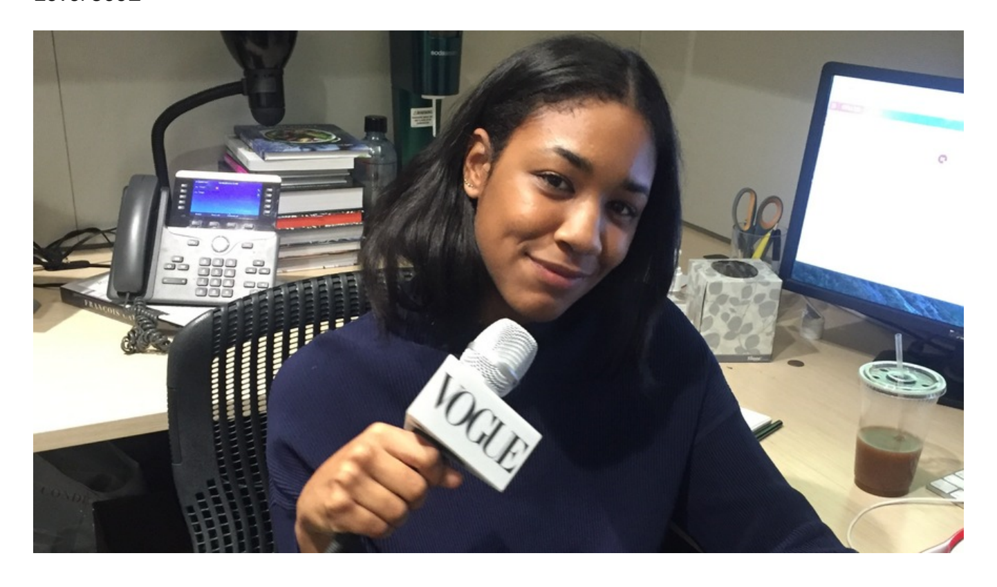
Image 1. Nia Porter is an editor at Vogue, a fashion magazine. In this role, she writes articles for Vogue's website and creates content for digital platforms like Snapchat.

By Hailee Romain, adapted by Newsela staff on 10.15.18 Word Count 638 Level 360L