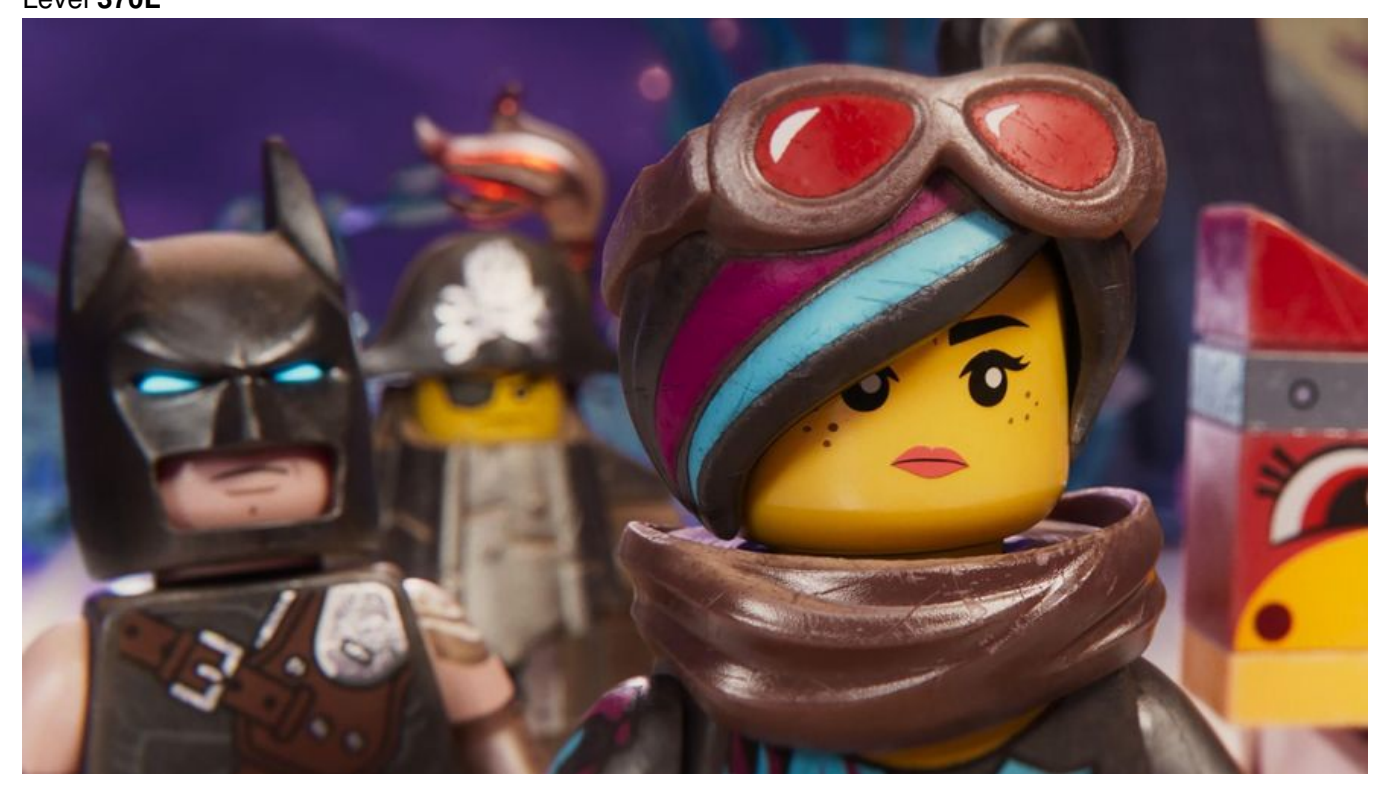
Image 1. Batman, Wyldstyle and the gang return in "The Lego Movie 2: The Second Part."

By Brian Truitt, USA Today, adapted by Newsela staff on 02.14.19 Word Count 350 Level 370L