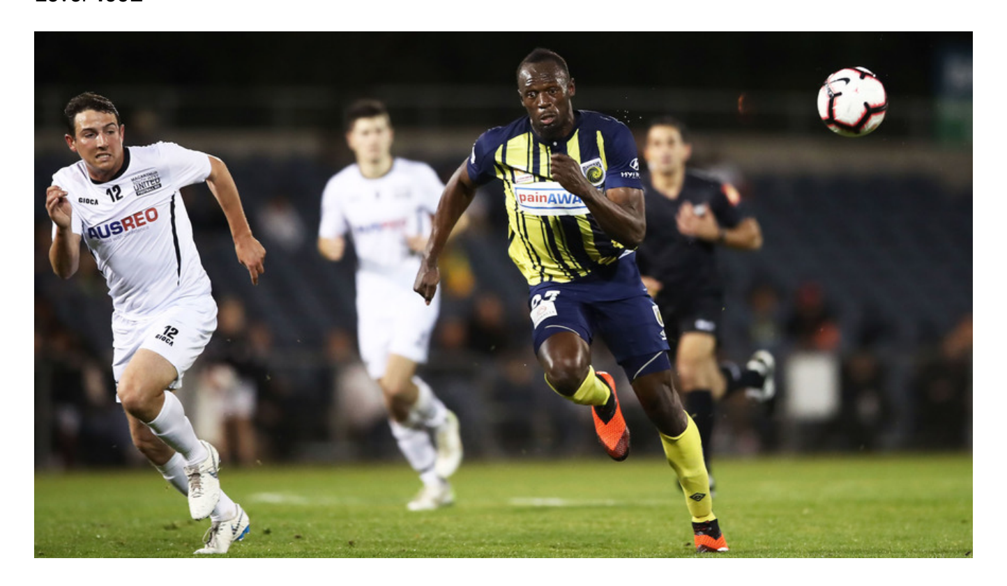
Image 1. Usain Bolt (right) of the Mariners controls the ball during a preseason match between the Central Coast Mariners and Macarthur South West United at Campbelltown Sports Stadium on October 12, 2018, in Sydney, Australia.

By Washington Post, adapted by Newsela staff on 10.19.18 Word Count 387 Level 400L